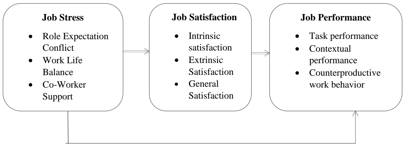
Figure 1: Conceptual framework of job stress, job satisfaction and job performance

The Conceptual framework shows that job stress is the independent variable, job satisfaction is the mediating variable and job performance is the dependent variable. Figure 1 shows that, job stress directly influences job performance and also indirectly influences job performance through job satisfaction. Furthermore, the conceptual framework enlightens that job stress influences job satisfaction and job satisfaction has a direct influence on job performance.