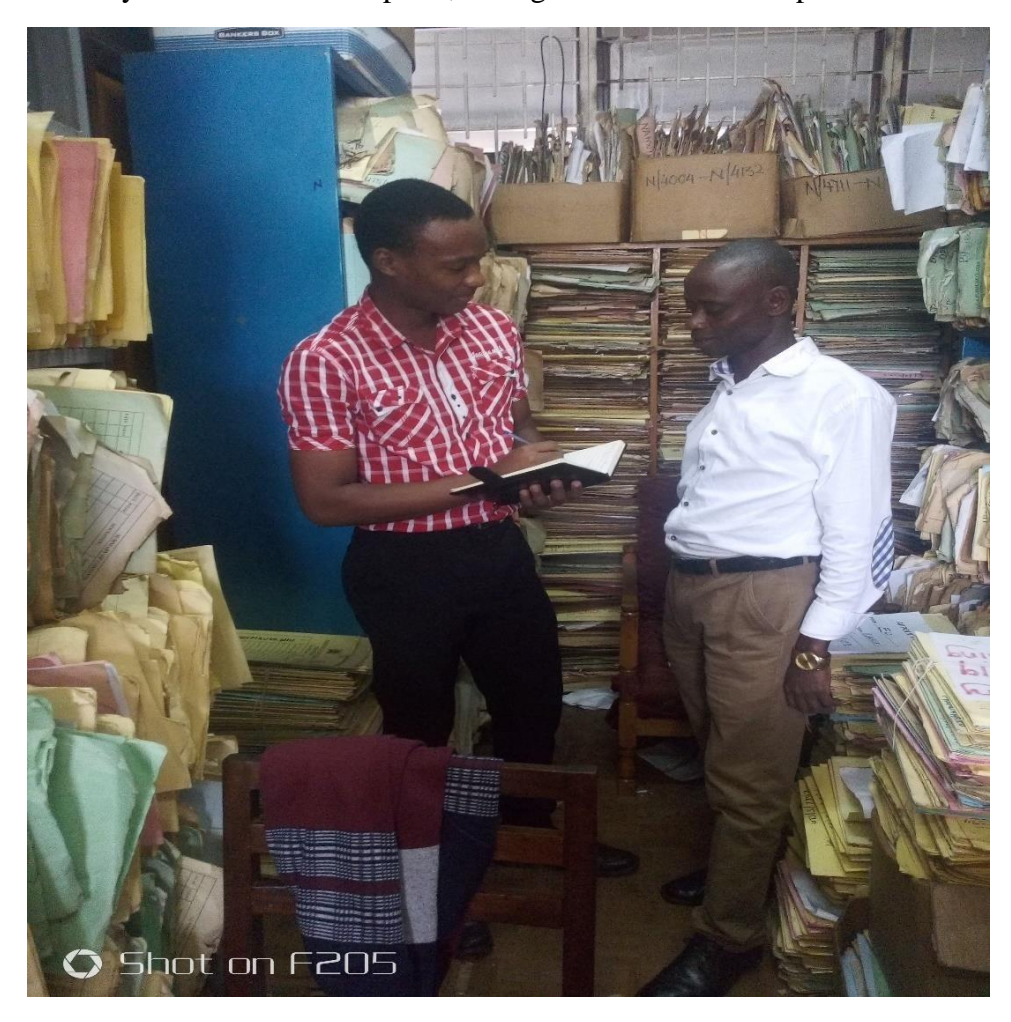
FIGURE 2.1 Showing the researcher (left) interviewing one of the record assistants at the Ministry of Education and sports, during his data collection process